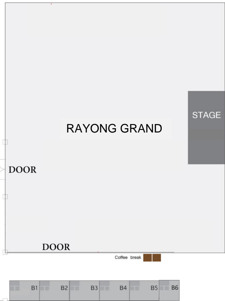
PLAN 1 st floor